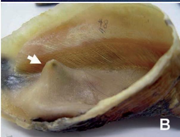
Figure 2. A. Pedal osteolysis is seen on the abaxial wall of the P3 bone of the medial digit (white arrow). In the lateral digit, bony ankylosis was seen between the P3 and distal sesamoid bone. B: The inner surface of the footpad horn in the heel region of the lateral hind claw is hypertrophic.

when VF is present. The bending of the claw may be associated with a fault (horizontal fissures) or may occur because the tensile strength of the claw has diminished (Greenough, 2001). This case would not show any sign of concavity of the dorsal surface or angling of the solar surface. Therefore, the cause of VF is not related to contributory factors such as laminitis or trace element deficiencies.