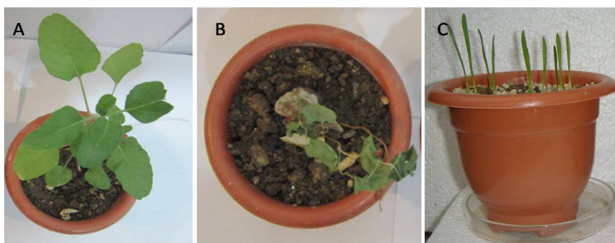
Figure 3. C. draba and wheat in pots one week after injection of extracts. (A) C. draba after injection the 500 µg/ml dilution of non-inoculated ISP2 extract (control). (B) C. draba after injection the 500 µg/ml dilution of the extract of the isolate UTMC 2102. (C) wheat after injection the 500 µg/ml dilution of the extract of the isolate UTMC 2102.