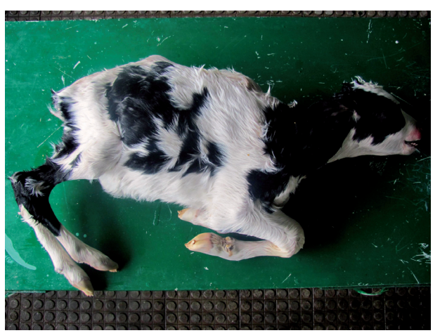
Figure 1. A Perosomus Elumbis calf with angular hind limb and lumbar deformities.

Congenital defects can result from disruptive