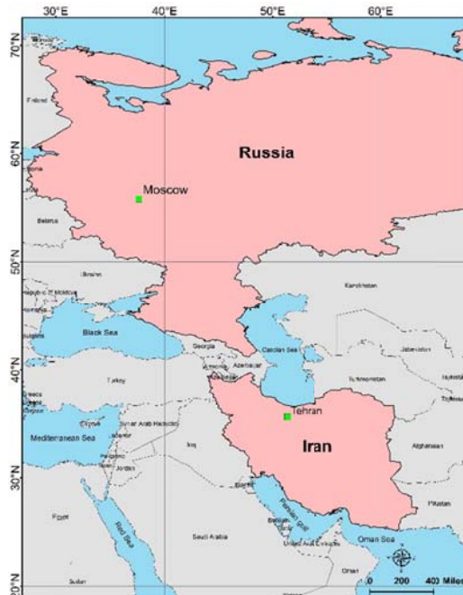
Figure 1. The geographic location of the metropolitan areas of Moscow and Tehran.