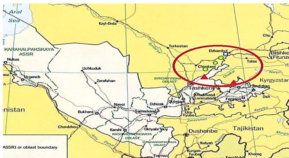
Fig. 1. Geographical area in which walnut genetic resources were examined within the borders of Kazakhstan

The seedling of Persian walnut ( Juglans regia L.) trees were identified and evaluated at Jabağıl, Tulkıbas, Sayram and Lenger regions of Kazakhstan and also at Botanical Garden of International Hodja Ahmet Yesevi Turkish-Kazakh University of Kazakhstan (Fig 1). In the year 2015-2016 an exploring expedition was conducted by an international team of Turkish and Kazaki researchers, during vegetative season in the above mentioned regions to explore, identify and collect walnut genetic materials. The climate data of each region are reported in Table 1.