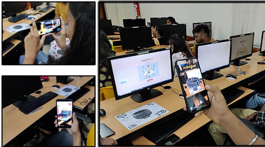
Figure 2. Respondents experiencing AR presentation following their MOOC experience

The class has been asked to see the MOOC video on their mobile phones first. The respondents did not have any restrictions on the number of times the video can be seen. Once all the respondents were done watching the course, they filled the questionnaire.