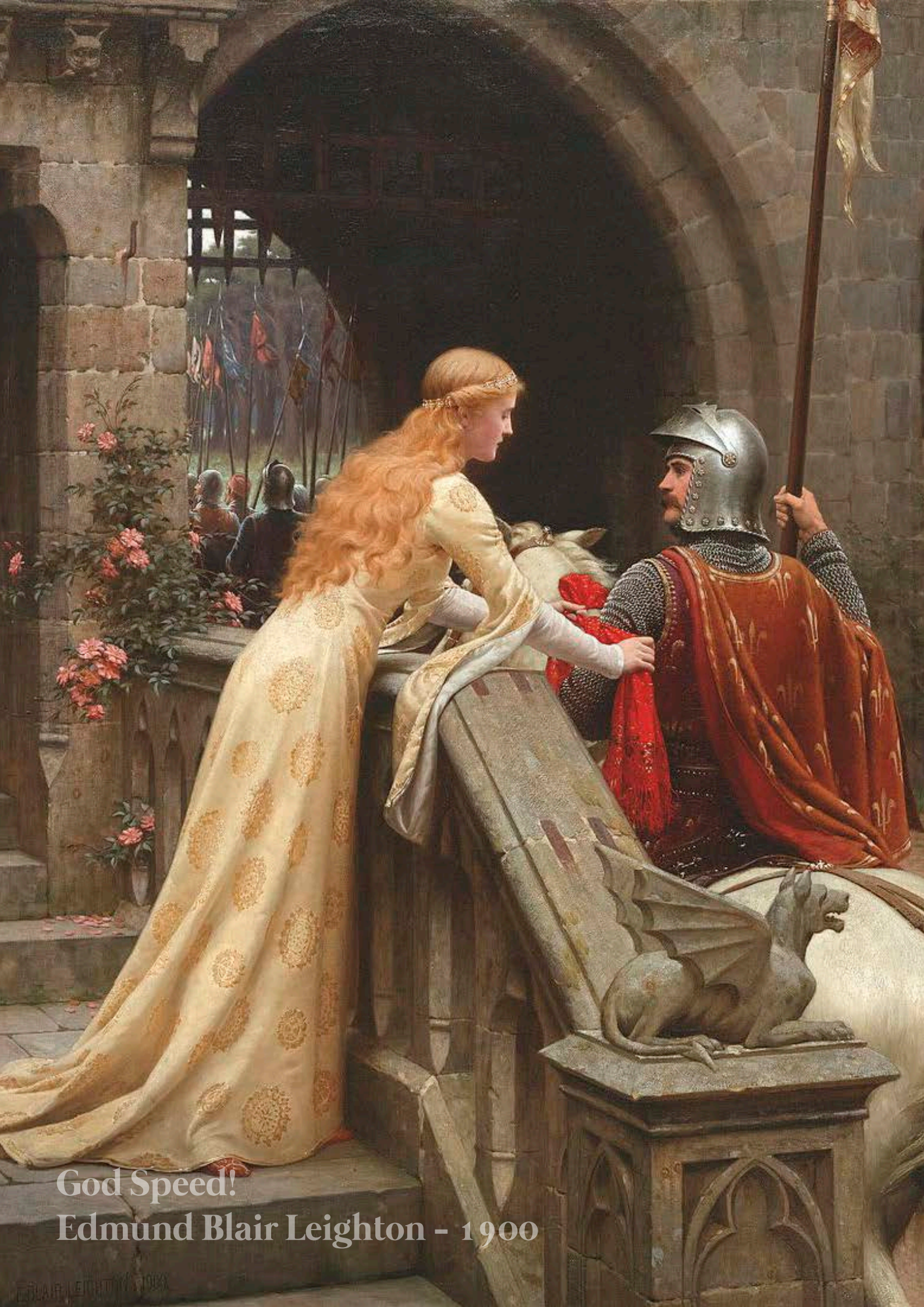
God Speed! Edmund Blair Leighton - 1900