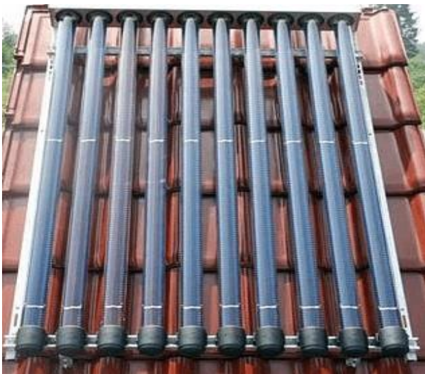
Figure 1. System of evacuated-tube collector

In Figure 1, we see a solar energy device made of tubes placed on the roof of a house to provide hot water.