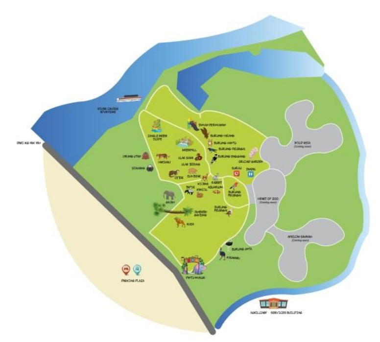
Figure 1. Map of Kemaman Zoo and Recreation Park (TRZK), Terengganu

Borneo orangutan ( pongo pygmaeus ) is one of the attractions at the park. The Borneo orangutans differ in appearance from the Sumatra orangutans, in which the former has a broader face, shorter beard, and slightly darker color. The lives of Borneo orangutans are at stake at the moment. The species is listed as endangered under the IUCN Red List of threatened species and is protected under the law because of forest or habitat loss and illegal hunting. Currently, a statistic by the IUCN Red List shows that Borneo orangutans have decreased by more than 60% between 1950 and 2010, and a further 22% decline is projected to occur between 2010 and 2025 (World Wild Life, n.d.).