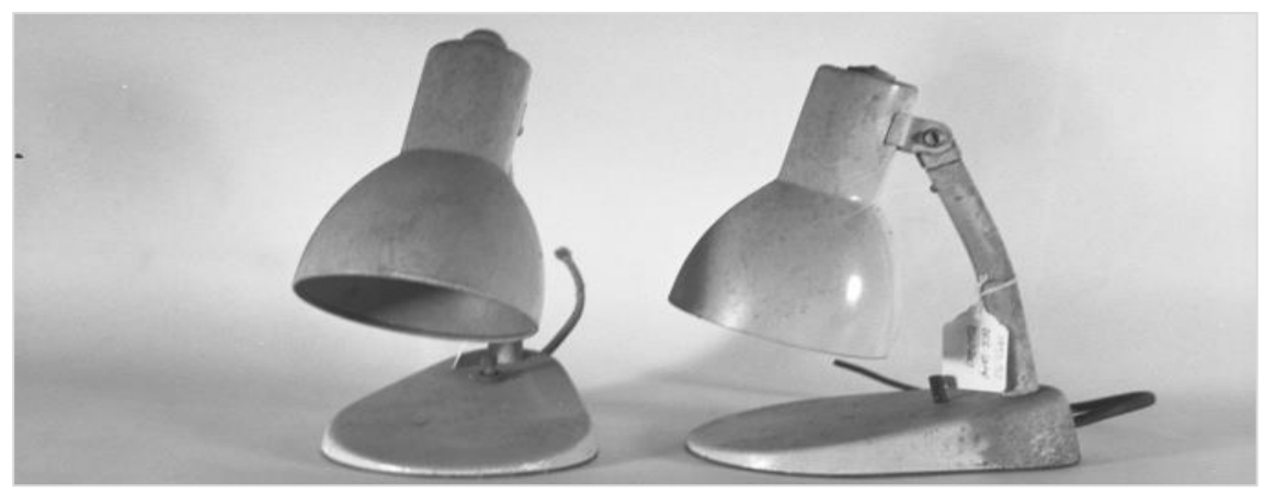
Figure 2: "Kandem" Bedside-Table Lamp, Harvard Art Museums/Busch-Reisinger Museum, Anonymous gift. Designed by Marianne Brandt in 1928

An analysis of the Bedside Light designed for Kandem (Figure 2) reveals that Brandt was moving on from some of the original Bauhaus ideals that were so elegantly expressed in her earlier works. From a focus on form and materials, Brandt was now engaging with the challenge of designing usable, economical and aesthetically pleasing objects in the context of mass production. The Kandem project represents Brandt's first move away from the creation of iconic objects to the role of industrial designer for manufacturers of mass-produced objects (McDermott & Pandolfo, 2019).