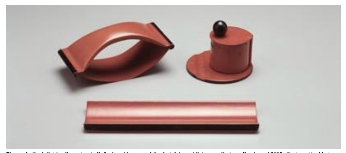
Figure 4: Desk Set for Ruppelwerk, Collection: Museum of Applied Arts and Sciences, Sydney, Purchased 2002. Designed by Marianne Brandt in 1930-31.

The lineage of the forms in many of the Ruppelwerk objects can be traced back to those used extensively during the Bauhaus. The Sugar Bowl, Candelabra and Napkin Holder (Figure 3) do use pure geometric forms as seen in the Bauhaus; however, these forms are transformed as products suitable for a domestic context. As a further step, Brandt went on to challenge this approach of using simple geometric forms in the Desk Set she designed for the Ruppelwerk collection.