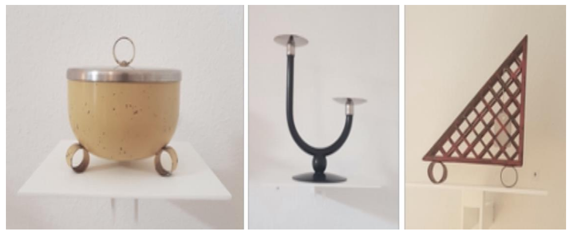
Figure 3: Sugar Bowl, Candelabra and Napkin Holder. Designed by Marianne Brandt.

While Brandt remained faithful to the Bauhaus goal of avoiding ornamentation in object design, she was resourceful in achieving high aesthetic qualities as she understood that a visually appealing object would impact positively on the customer. She stated that Instead of painted or sprayed decorations [...] I created effects by screwing or riveting other coloured parts, e.g., wooden balls, and chrome metal (ibid). This approach to create an effect is evident in the Sugar Bowl and Candelabra in Figure 3 where contrast between finishes is highlighted.