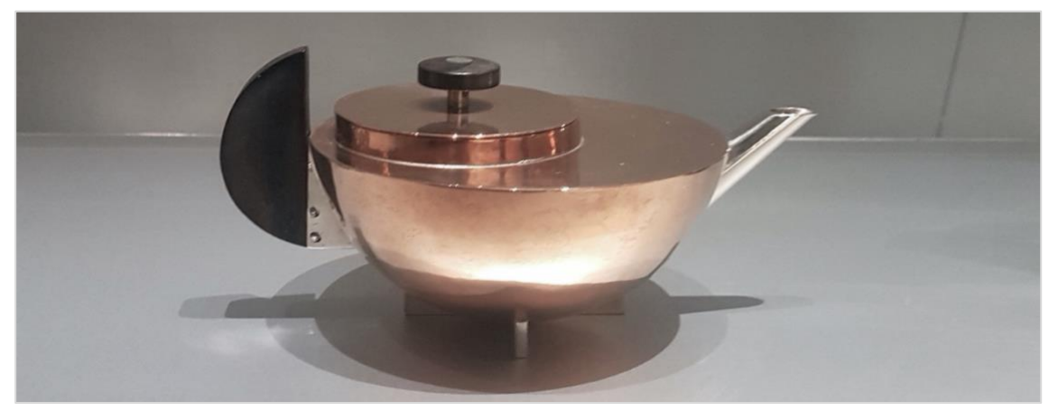
Figure 1: Tea infuser (MT 49) from a display at the Bauhaus Museum Weimar. Designed by Marianne Brandt in 1924.

However, despite the undoubted beauty of this object and the stated aim of the designer, it was not suitable for mass production. The only examples are all handmade and are valuable items (Sellers, 2017).