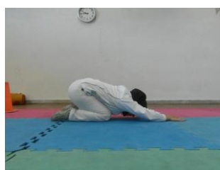
Stretching 3set 5 to 15 sec