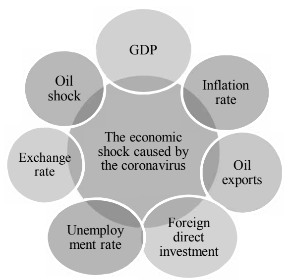
Figure 1. Theoretical Model of Corona Shock.

In this section, using the materials mentioned about the impact of the epidemic on the economy, a theoretical model is explained in relation to the impact of the outbreak of COVID-19 as an economic and political shock on the Russian Federation.