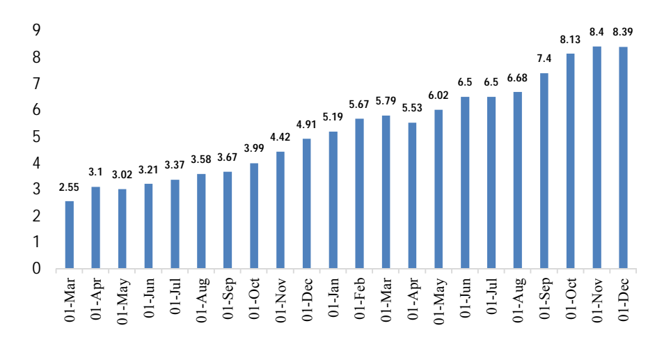
Chart 3. Inflation Rate in Russia (2020 – 2021).

Regarding the increase in inflation due to the spread of Coronavirus in Russia, it can be said that as shown in Chart 3, this figure increased from 2% in 2020 to 8% in 2021 since the beginning of the outbreak of the disease in Russia. Despite the fiscal policies adopted by the country's central bank, Russia is facing high inflation. The head of the Central Bank of Russia, Elvira Nabiullina, has noted that the steady rise in the general level of prices for goods and services in Russia will be a long-term phenomenon. The problem, she reflected, has previously occurred in the country in the late 1990s and 2000s.