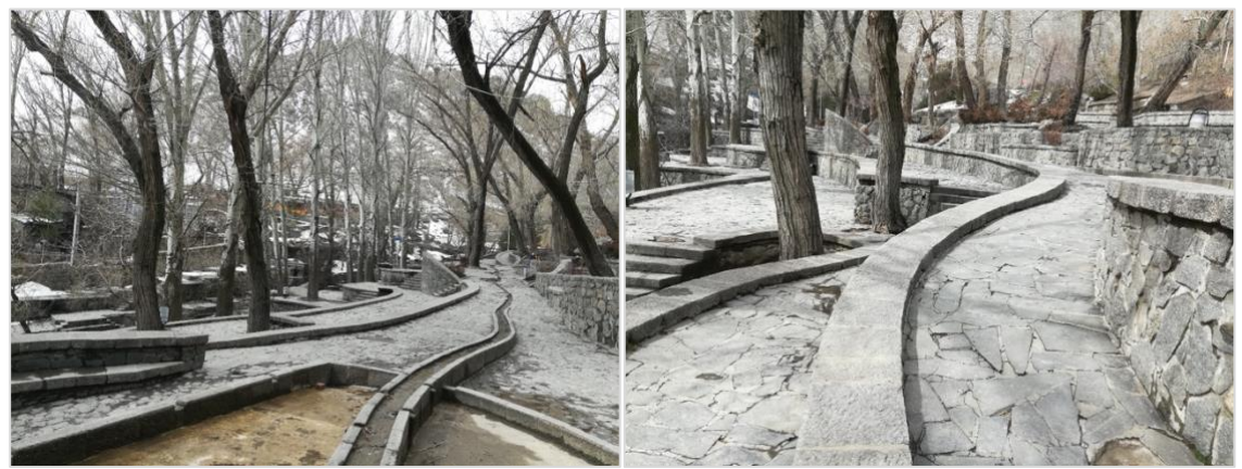
Figure 1: Location of Ganjnameh Mountain Park.