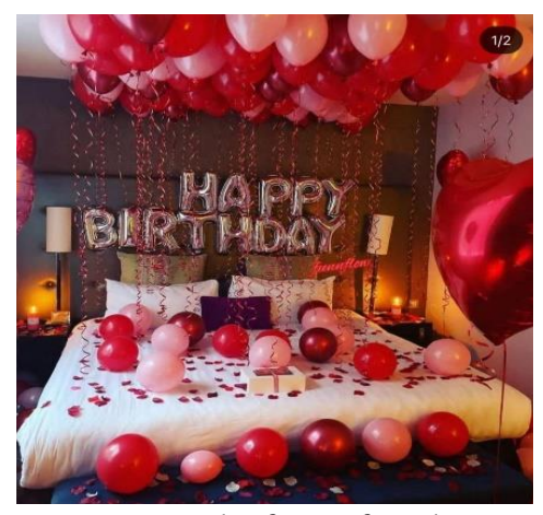
Figure 6. Luxury in the form of implementation

As mentioned before, Veblen considered basis of people's dignity to portrayal of wealth to conspicuous consumption and leisure. Z. A. and M. Sh. are so mentioned the types of luxury gifts and their conspicuous nature in pseudo-events of micro- celebrities.