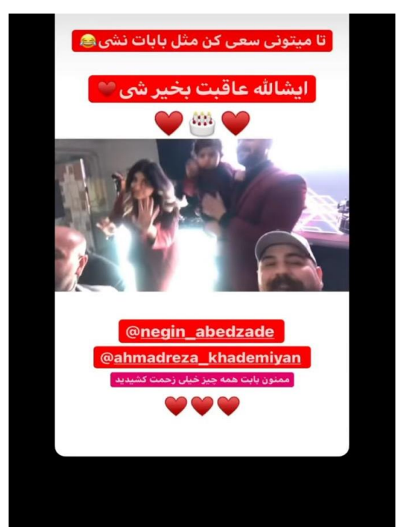
Figure 4. Practical events

collared interpretations of how their maker or makers perceived and reconstructed the reality (Serafinelli, 2018: 41).