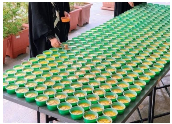
Figure 8. Planned humanitarian actions

M. S. stated regarding micro-celebrities' humanitarian activities: "we cooked sholezard (an Iranian traditional desert). I think there were at least 1000 bowls of sholezard. It was supposed to start pouring and distributing them from 12 o'clock. N. D. said – let's gather 500 bowls and arrange them beautifully so that I can take a good photo. We insisted that people were waiting, and the desert would cool down; however, it was useless. Our work was delayed for almost two hours as she took images from various angles for her stories and posts."