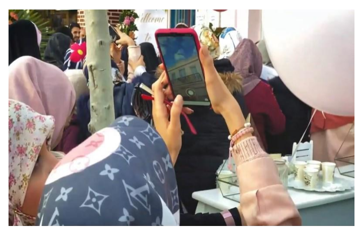
Figure 3. Practical rules 1

"the other time that I had been invited to their birthday party everybody was holding a cell phone, and no one put them down. The poor child whose birthday was being celebrated did not understand anything at all from noise. Honestly, even adults like me were bored among all those influencers as everybody was sharing stories."