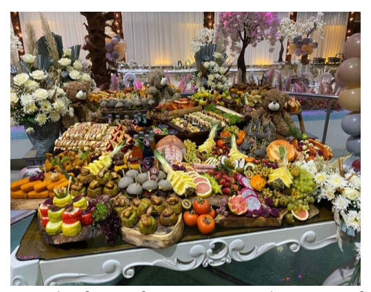
Figure 7. Luxury in the form of presentation, the types of refreshments

"In general, the gifts were very luxurious and expensive, particularly the gifts that an influencer give to other influencers. That is because they know the images will be shared via stores. Thus, at least the box, its size, particularly the price of the gift is very important."