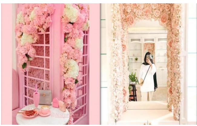
Figure 9. Location 2

As Sarah Frier, reporter of Bloomberg, said in "No filter: the inside story f Instagram": "after the graphic revolution and the emergence of Instagram, many businesses and various environments changed the manner of designing spaces and marketing their products to adjust them to the requirements of establishing visual relationships and making them fit to be displayed on Instagram (Frier, 2020).