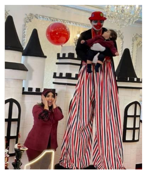
Figure 5. Form of implementation, staged