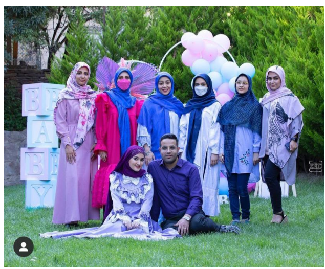
Figure 2. The present participants

• The present participants: They are physically present in the place where the event is held. Their images either have graphic or aesthetic values or have credit values that attract attention to the ceremony and increase the number of visitors. They include other micro-celebrities or the friends of the host micro-celebrity. They must take part in the ceremony according to the graphic values intended by the host to increase the consumption of the broadcasted content. The types of clothes, the match between the decoration and the color/design of the clothes, the placement of the guests in the ceremony, and the guests' behavior and representing it are adjusted according to the hosts' intended images. Indeed, the guests take part in the ceremony as second-degree audiences. The main goal of their participation in the ceremony is creating convenient images for the target audience of the events.