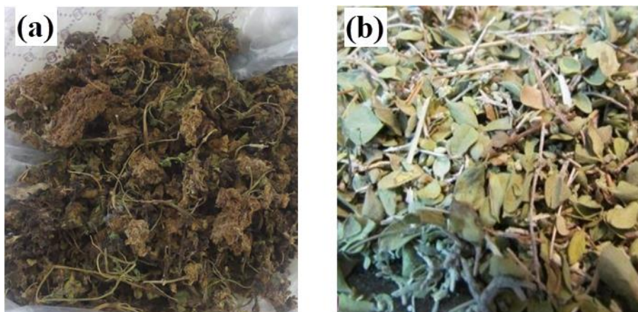
Fig. 3. Dried callus culture obtained by in vitro method (a) and Native plant (b).