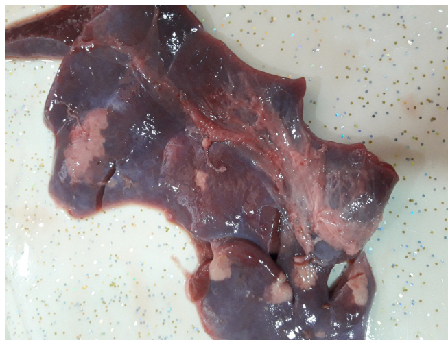
Figure 3. Livers infected showing discoloration, swelling, hyaline, the sharpness of liver margins loss and biliary fibrosis