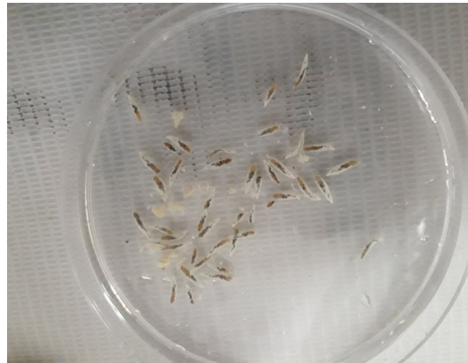
Figure 1. Severe infection with D. dendriticum , worms isolated from the bile ducts of sheep's liver