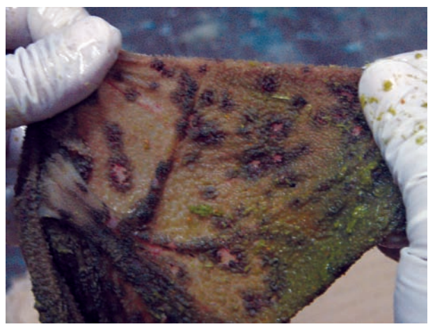
Figure 2. Necrotic rumenitis in the Shoka deer calf.

There is one report about allergy in man which appeared due to proteins from milk of goat and sheep which cause eosinophilic esophagitis (Rezazadeh et al., 2009). In addition, Campylobacter jejuni enteritis is found in human after consuming raw milk of goat (Harris et al., 2000; Simpson, 2002). Another report shows the allergy that appeared in human was a crossaction to milk of cow, sheep, wild goat, buffalo, camel and deer (halal meat) (Menzies, 2008). This report shows that the people who had allergies to cow-milk, also have allergies to milk of deer, wild goat and buffalo (Mellor et al., 2004). Mild inflammation of forestomachs could be observed in young calves which used a bucket for milk intake, especially when